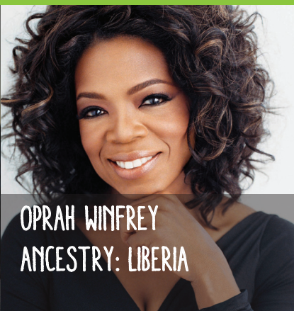
OPRAH WINFREY ANCESTRY: LIBERIA