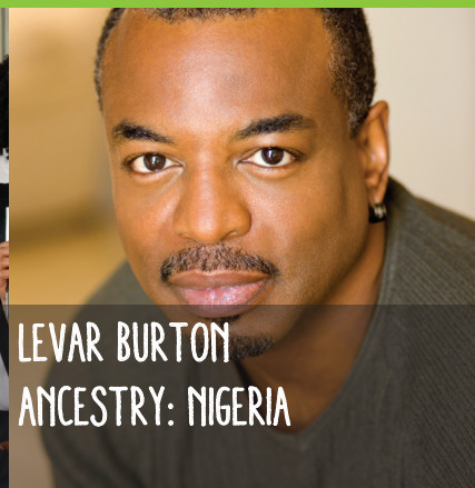
LEVAR BURTON ANCESTRY: NIGERIA