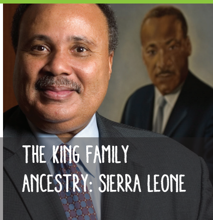
THE KING FAMILY ANCESTRY: SIERRA LEONE

An African Ancestry Project-Based Learning Program