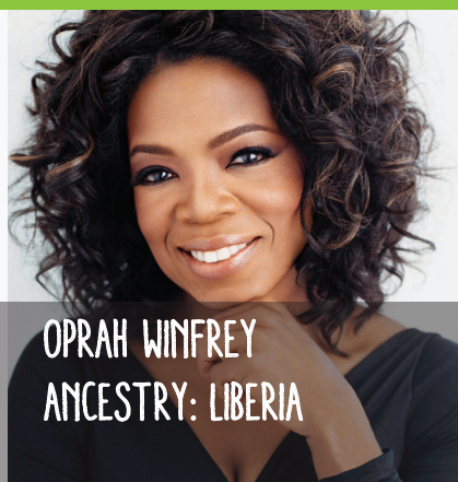
OPRAH WINFREY ANCESTRY: LIBERIA