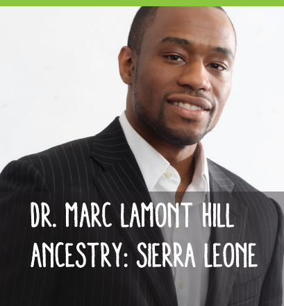
DR. MARC LAMONT HILL ANCESTRY: SIERRA LEONE

An African Ancestry Project-Based Learning Program