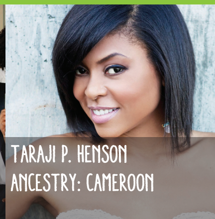
TARAJI P. HENSON ANCESTRY: CAMEROON